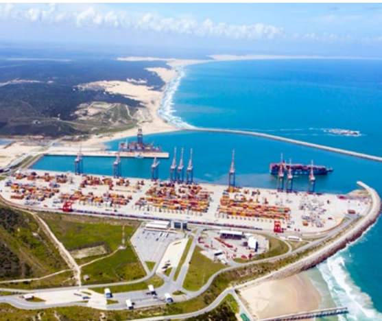
▲ Port of Ngqura