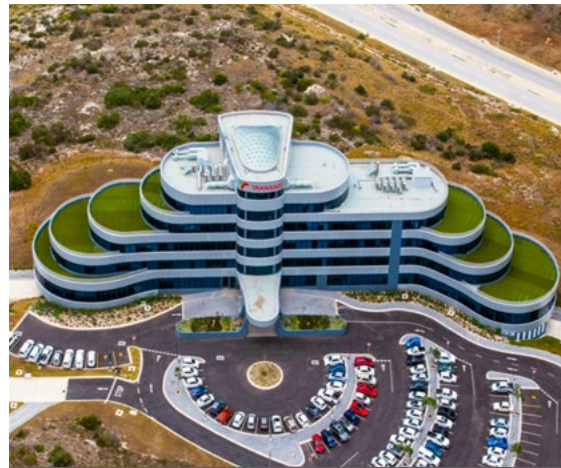
▲ eMendi admin building

Transnet plans to consolidate both the Parktown and Kingsmead Head Offices at the Port of Ngqura in Nelson Mandela Bay in the newly built R255m eMendi building - a modern building that is fully compliant with sustainability principles. Occupying our own buildings is part of our cost containment strategy and the building is being recapacitated to accommodate us.